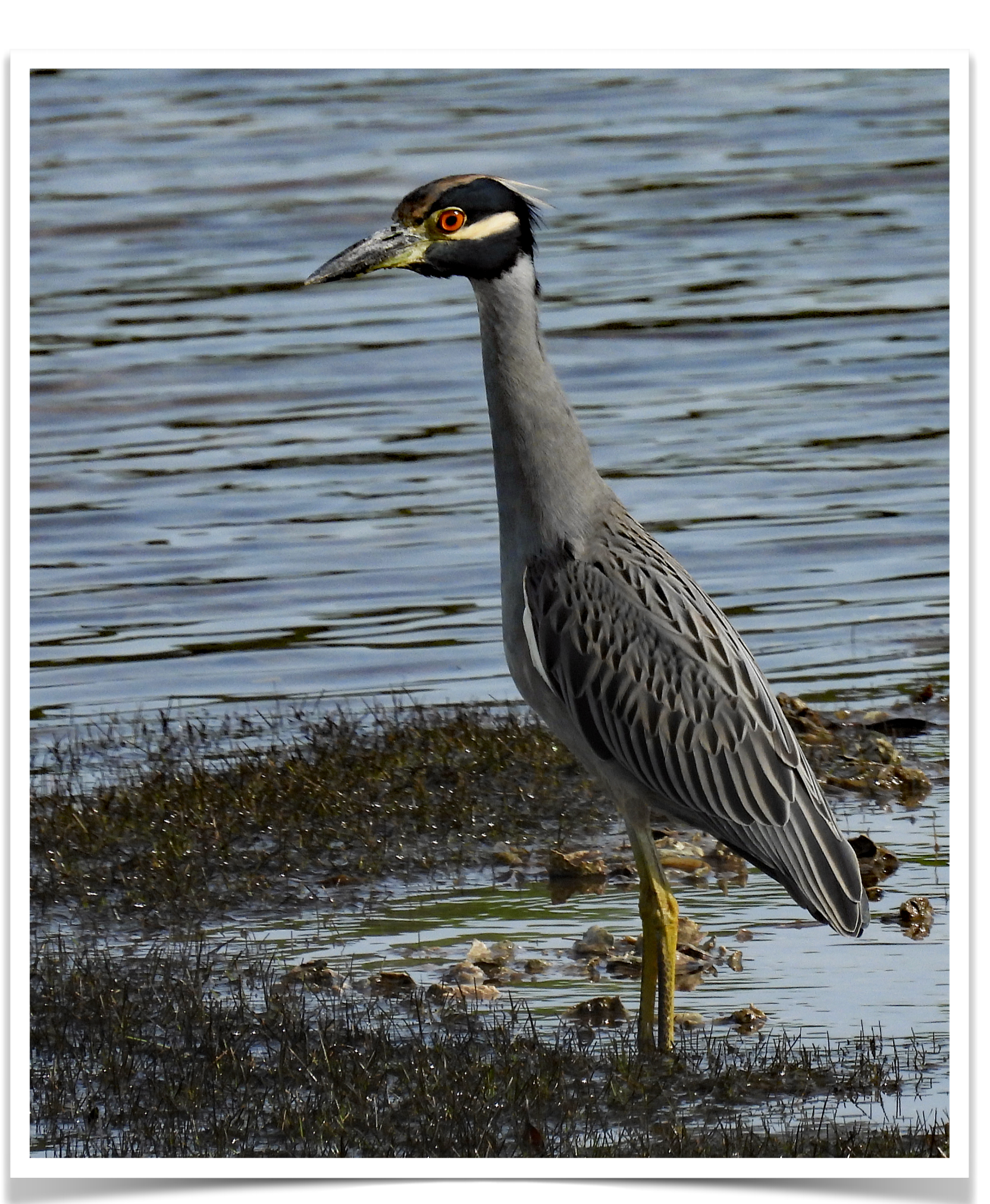
Yellow Crowned Night Heron