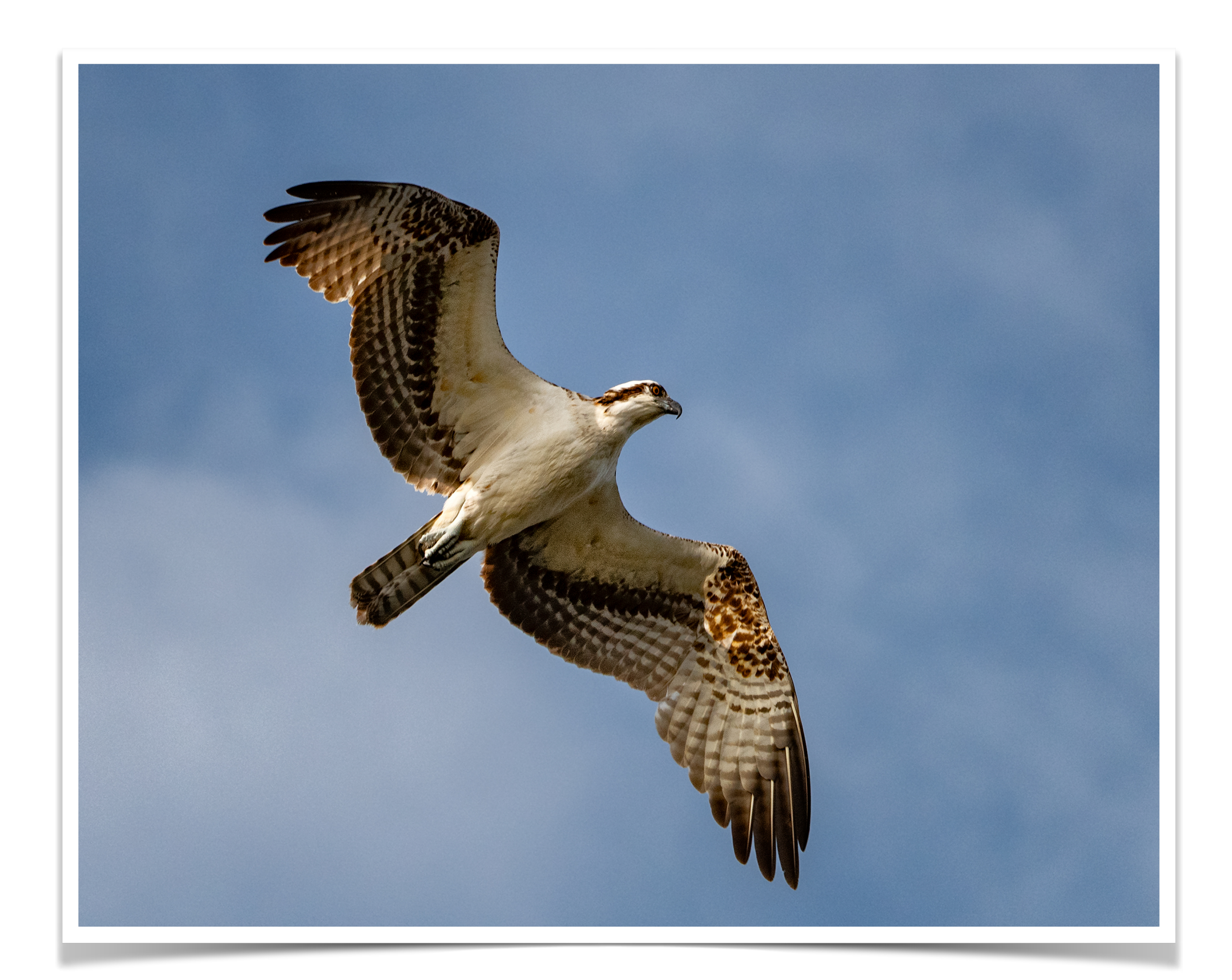
Osprey in Flight by Cheri Halstead