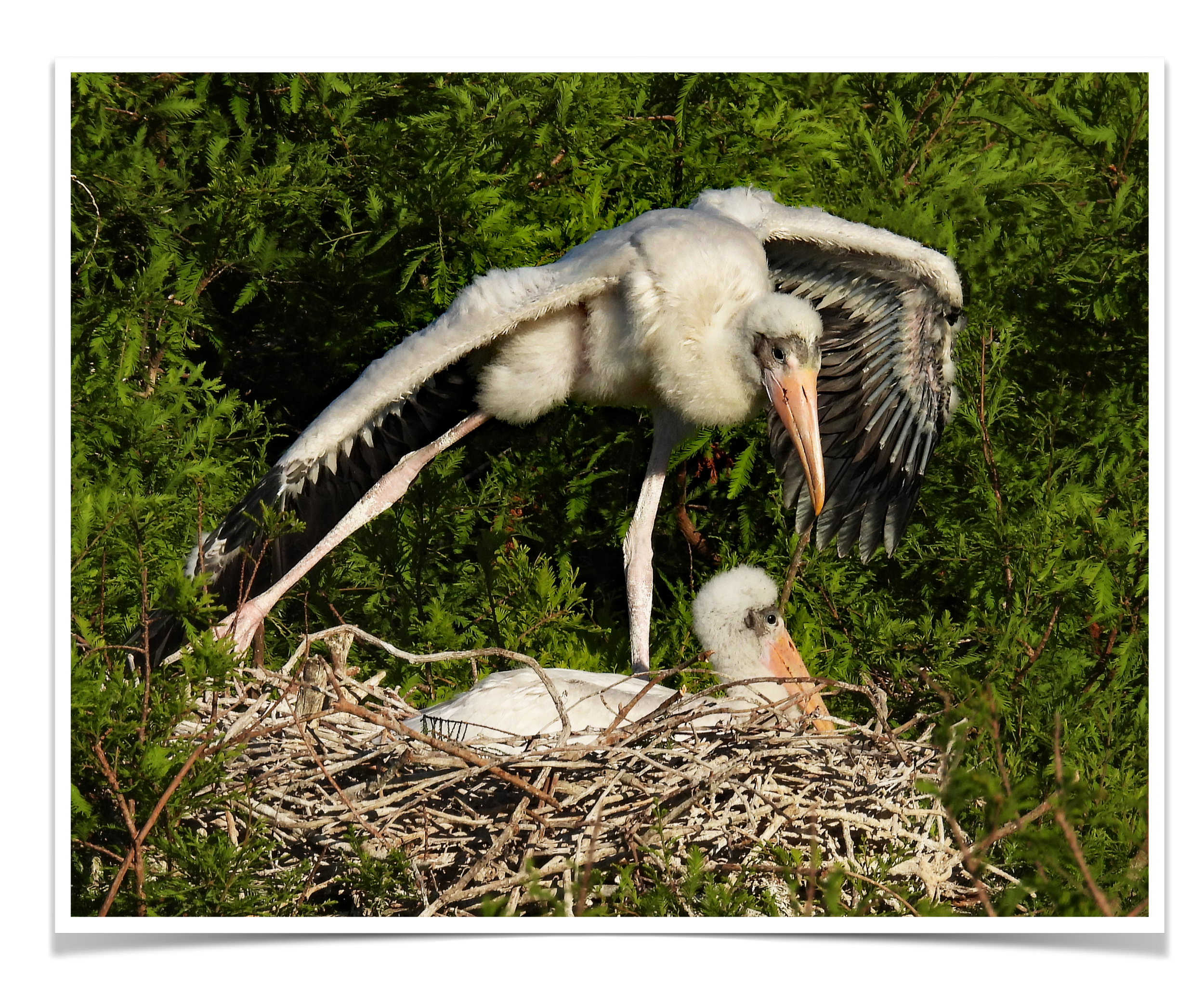
Two Wood Stork Babies in Nest