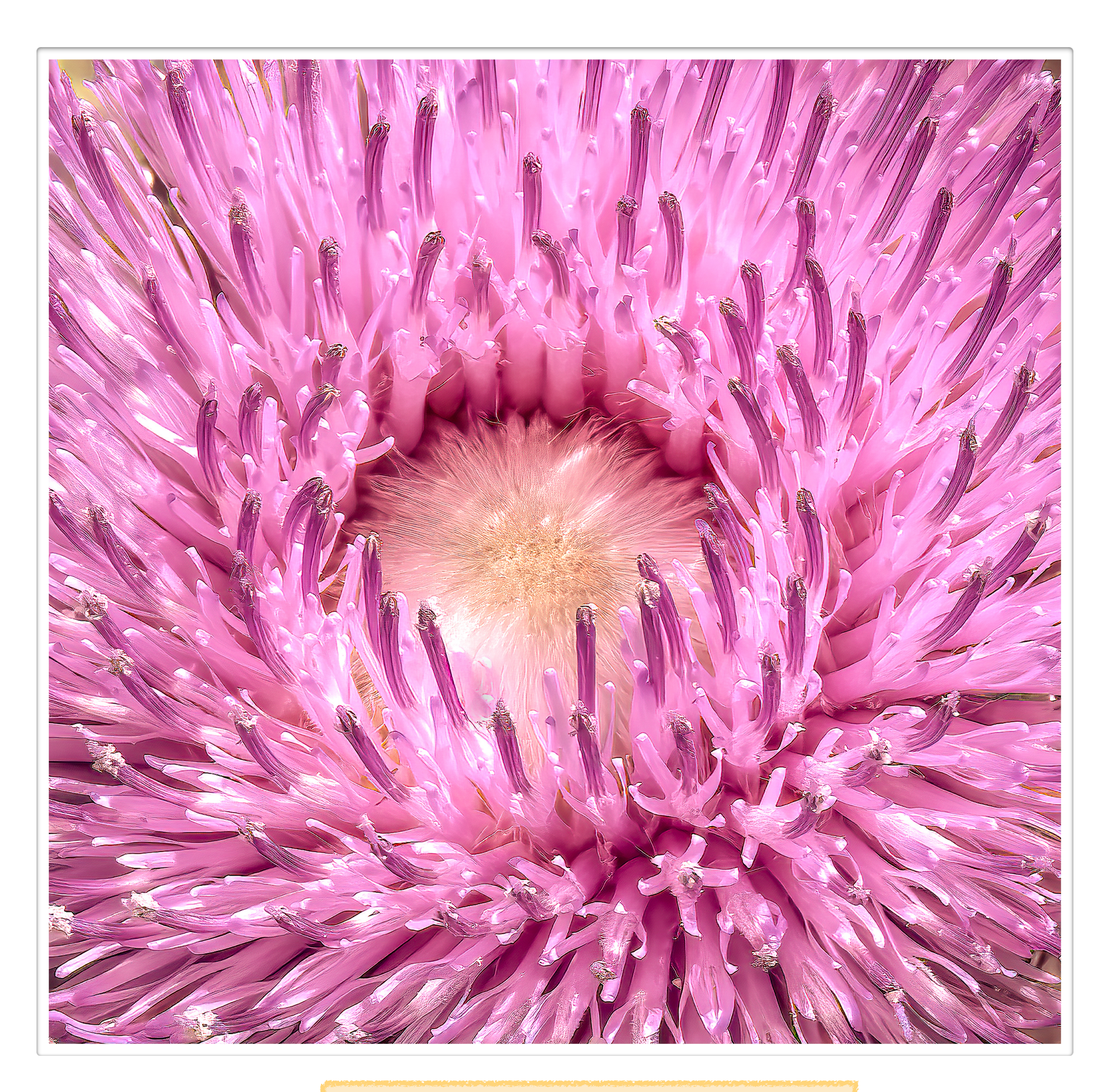
All the below photos Scored a 26