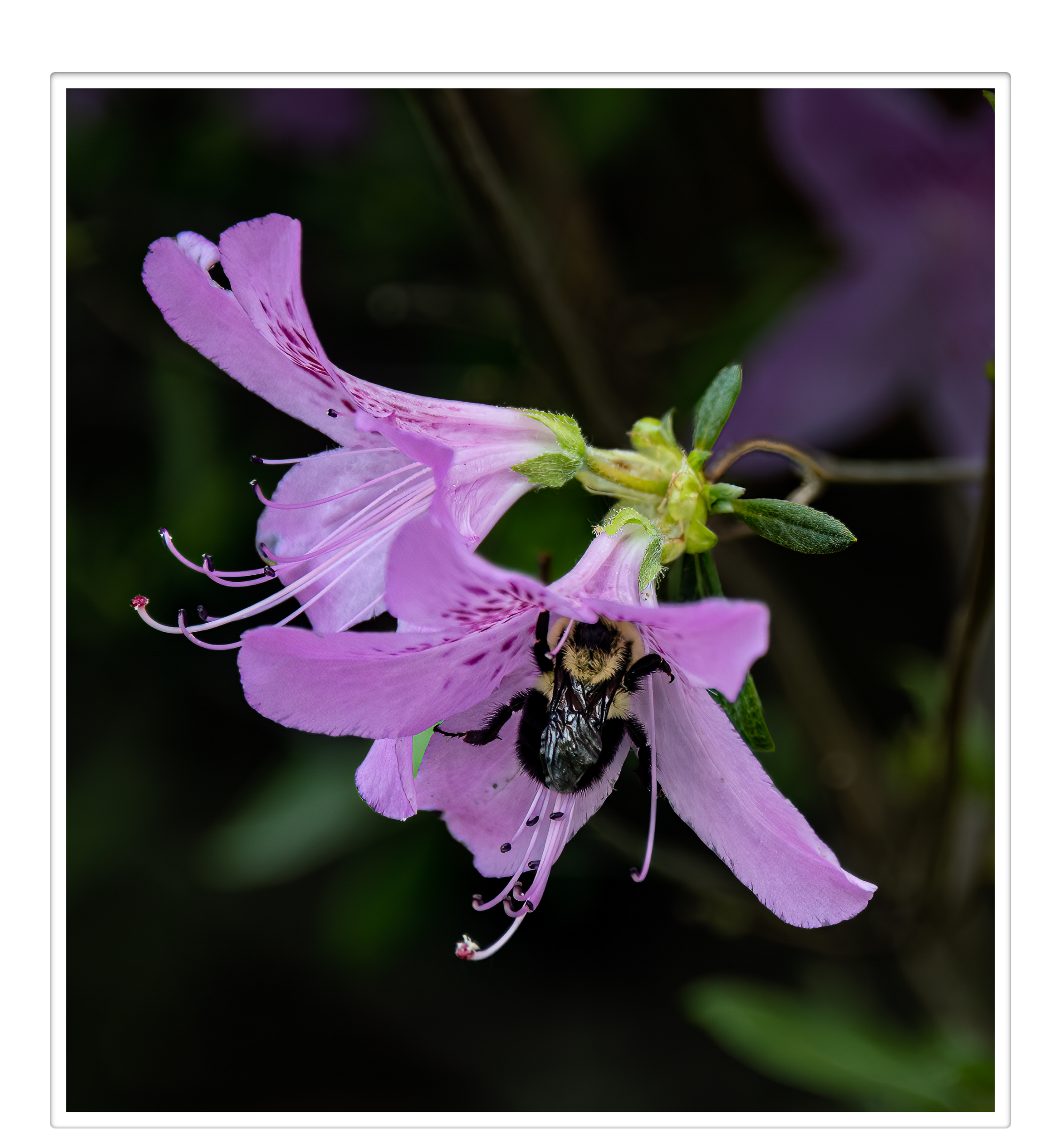
Good to the Last Drop