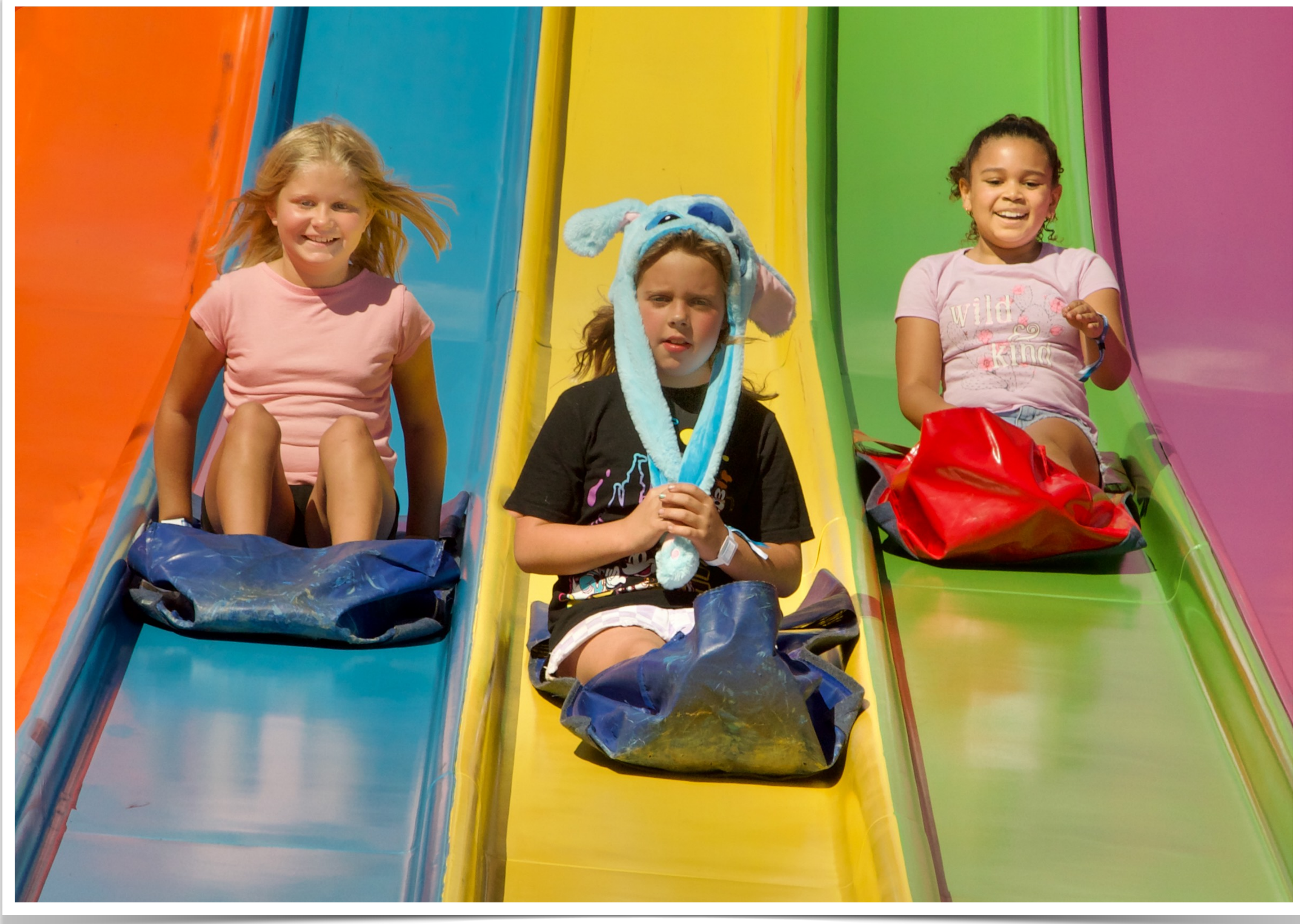
Sliding with Friends