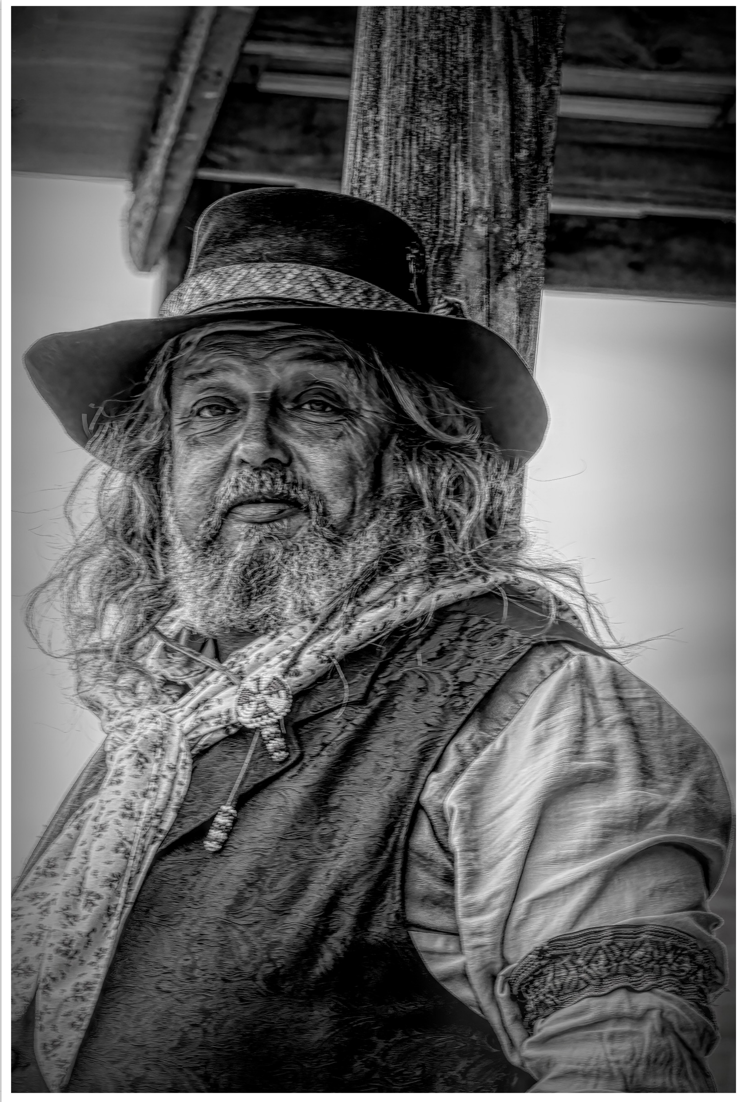
The Gunfighter by Don Kuhnle