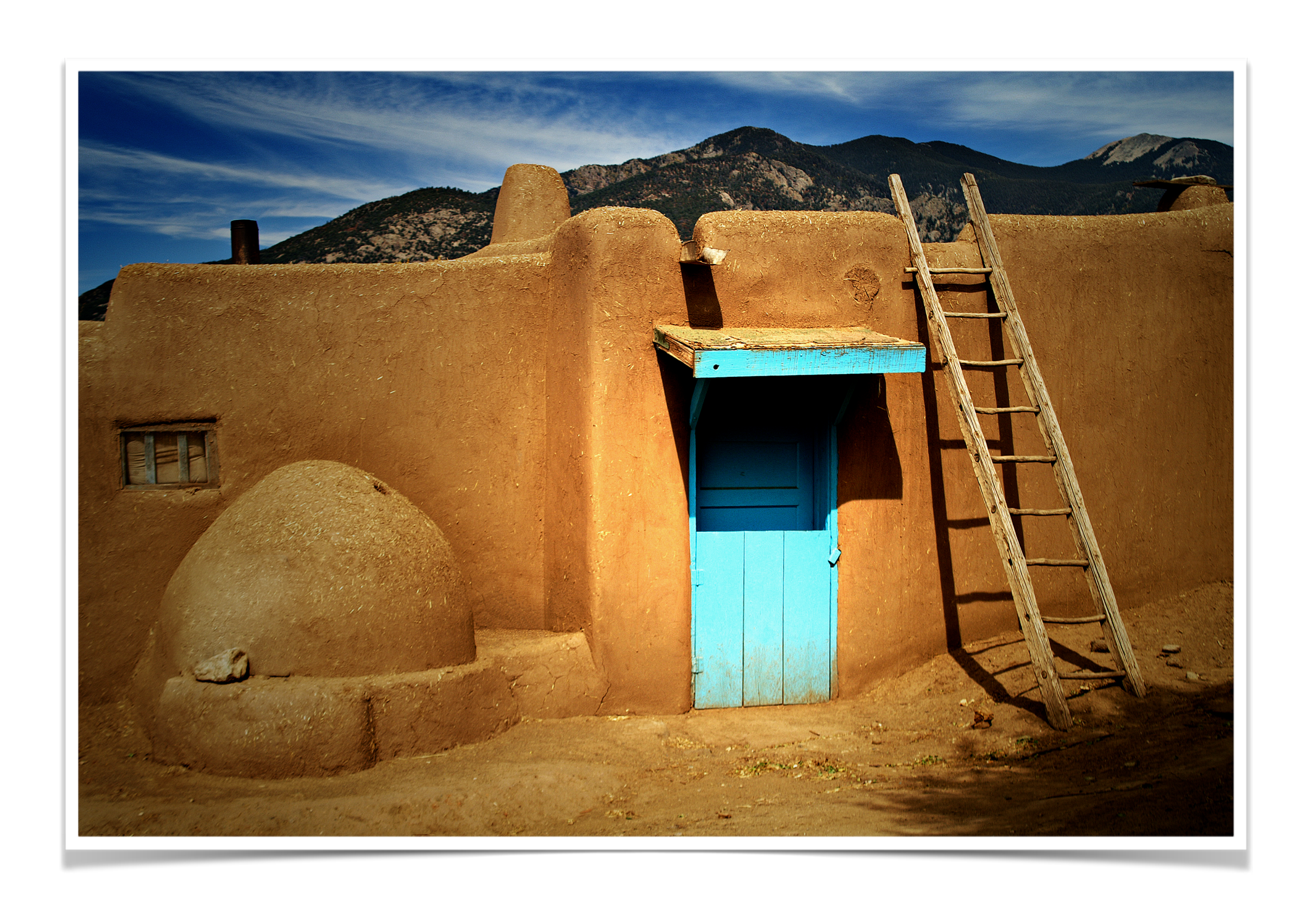
'Taos Pueblo Residence' by Georgia Robinson