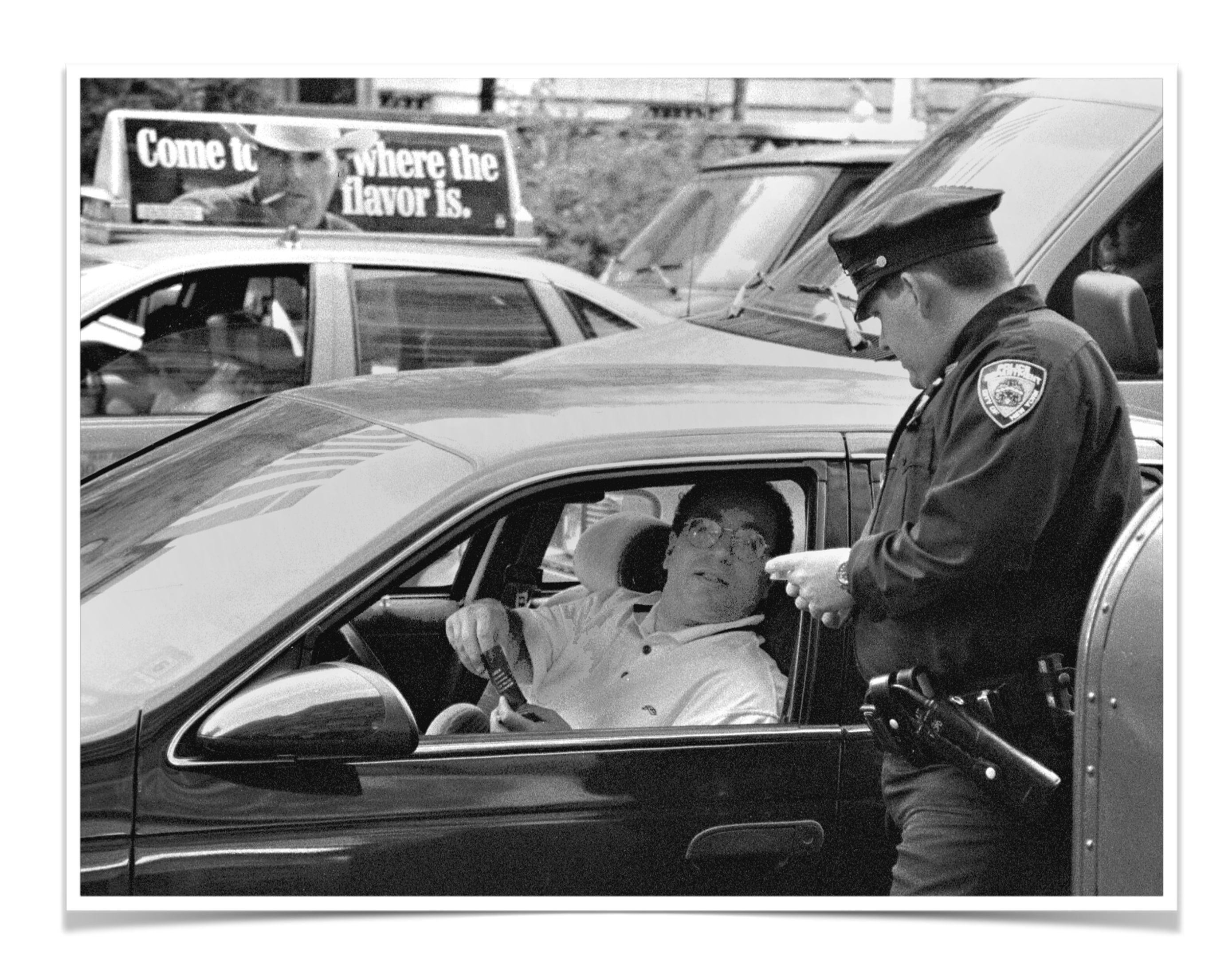
'No Excuses' by Joe Constantino